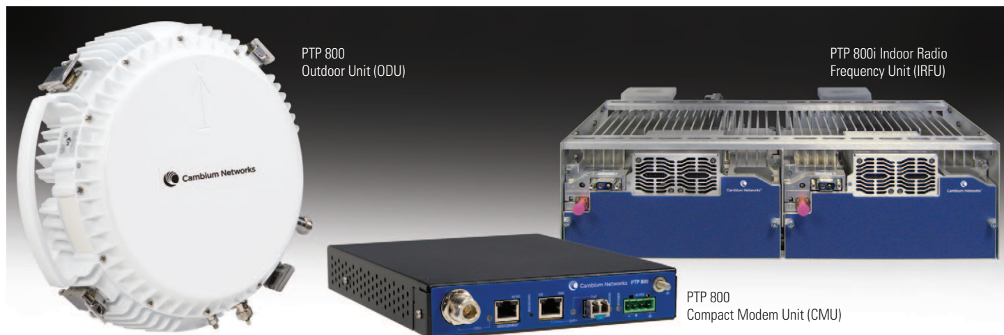
PTP 800 Outdoor Unit (ODU)